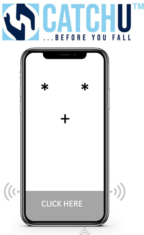
Figure 2. Introducing CatchU™. ... Before You Fall : CatchU™ is a quick and accessible mobile multisensory falls-screening tool that is based on over 15 years of multisensory research. Figure 2 depicts the look and feel of the CatchU™ app on an iPhone. Patients will be asked to complete this simple reaction time test by keeping their eyes fixated on the cross, and pressing the gray response area (i.e., “Click Here”) as soon as they see, feel, or see and feel any stimulation. Visual stimulation is presented here as asterisks displayed on the iPhone screen. Somatosensory stimulation is a vibration from Apple’s Taptic Engine. The visual and somatosensory stimulation can occur in isolation or concurrently as in the case of the visual-somatosensory stimulation condition.

accessible. However, several necessary studies are currently underway to validate that the CatchU™ accurately predicts falls just like our laboratory apparatus given that the look and feel of the assessment on an iPhone is inherently different compared to the established laboratory experimental setup and apparatus. Some of these alterations, necessary to move from a clunky and expensive lab apparatus to mobile and accessible iPhone, include differences in the visual and somatosensory stimulators, inclusion of an iPhone display, and a response pad change from foot pedal presses to finger presses on a touchscreen.